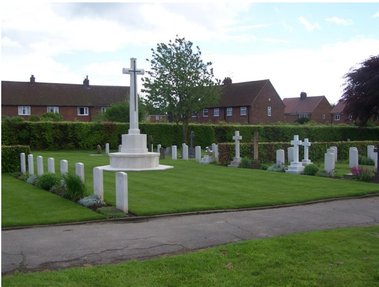
Cross of Sacrifice in Fulford Cemetery

Fulford Cemetery contains 235 Commonwealth Commission War Graves – 106 from World War 1 & 129 from World War 2.